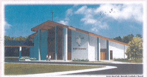
St. Paul the Apostle Catholic Church Baton Rouge, Louisiana, 2019, Pastor

Baptism: Call the Rectory to make arrangements. Infant Baptism is on the first Sunday of the month. Attendance of the pre-baptism workshop is required. Marriage: Make arrangements six (6) months in advance of wedding date with the pastor. Communion to the Sick: Please call the office to make arrangements to bring communion when someone is unable to attend Mass due to illness.