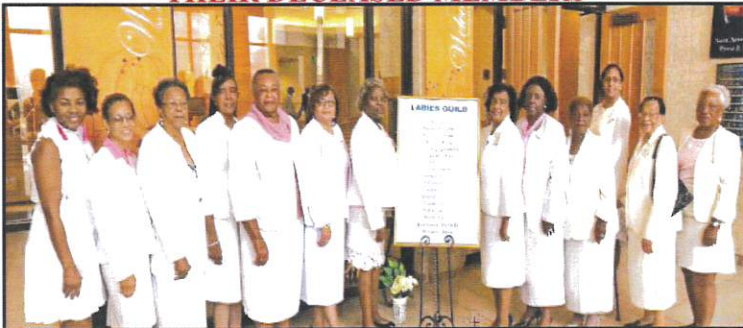
The members of the Ladies Guild turned out at the 7:30 Mass on Sunday, October 22, and purchased the floral arrangement that was in front of the altar last Sunday. Thank you, ladies!