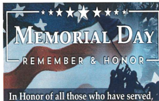
St. Paul reflects on your sacrifice and honors their memory with gratitude.