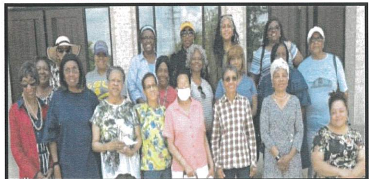
In observance of May as the Month of Mary, the Ladies Sodality prayed the Rosary for the sick and homebound members of St. Paul the Apostle Saturday, May 27 at noon in St. Paul's Prayer Garden.