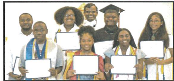
St. Paul celebrated their high school and college graduation last Sunday after the 10:30 AM Mass.