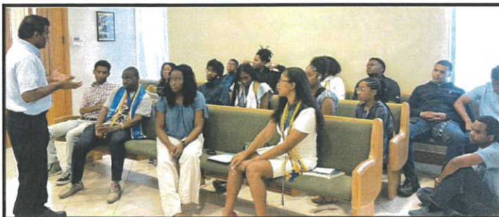
The young adults of St. Paul were invited to share their thoughts about how to increase their spirituality and Mass attendance