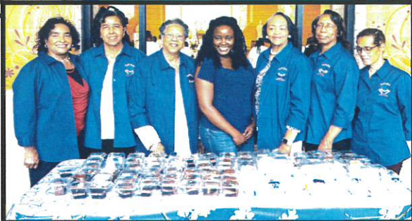
The members of St. Paul's Ladies Guild celebrated their 60th Anniversary of Service with a special event for the members and guests on Saturday, June 10, and provided sweets after each Sunday Mass on last Sunday, June 11.