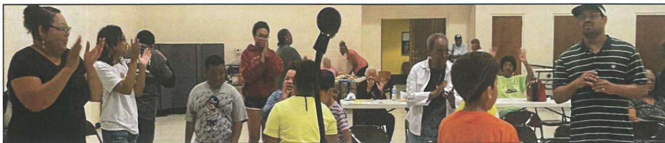
Some of the VBS participants on the move, Follow Jesus!

St. Paul's organizations below (Ladies Guild, Ladies Auxiliary of KPC, Women's Club & the Knights of Peter Claver) were ready to move prepping & serving the children, adults, teachers & staff for Vacation Bible School.