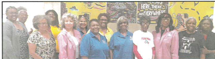
Ladies Auxiliary of the Knights of Peter Claver—Court 351