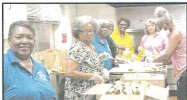
Ladies Auxiliary of KPC