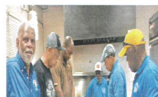
Knights of KPC