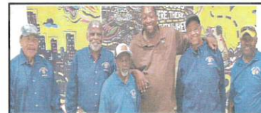
Knights of Peter Claver—Council 351