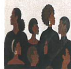
Erasing Mental Health Stigma in the Black Community

Mental health affects us all and everyone should have the right to be heard and healed without shame or judgment. Bebe Moore Campbell was committed to creating safe spaces for people in communities of color to connect with others who share similar experiences and cultural backgrounds. These safe spaces served as a gateway to vital mental health resources and support networks.