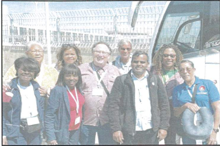
Thank God for the safe arrival of the nine members and friends of St. Paul who arrived safely for their tour of the Holy Land. They were ready to board their tour bus.