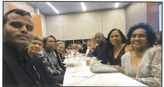
This is St. Paul's group who attended the Together Baton Rouge Annual Fundraiser on November 8, 2023, at the Goodwood Library