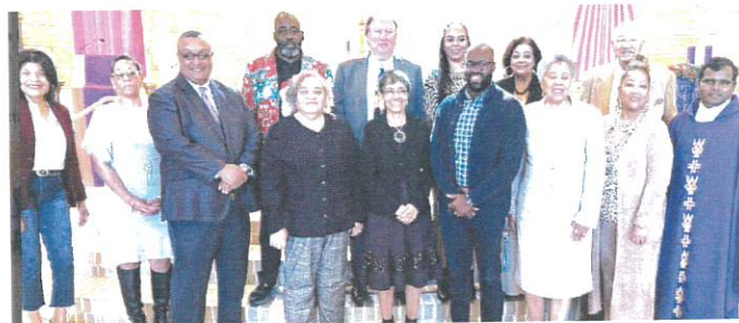
The above lectors/readers attended the 10:30 Sunday Mass and were recognized for their ministry, too.