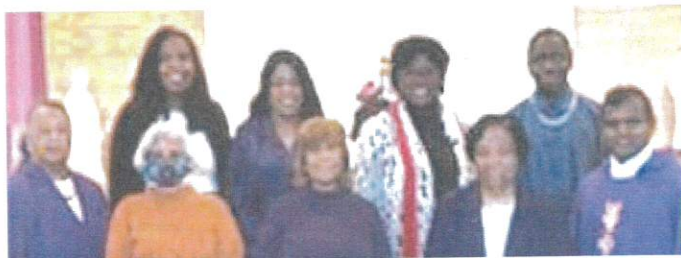
The above lectors/readers attended the 7:30 Sunday Mass and were acknowledged.