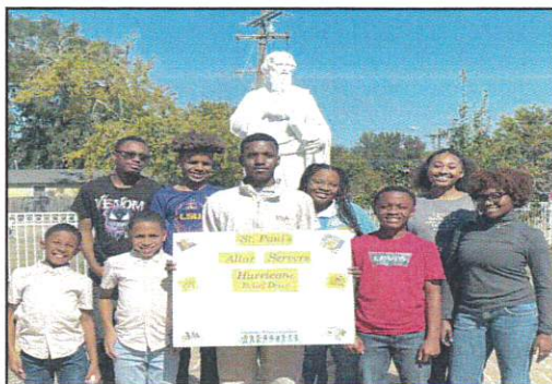
St. Paul's Altar Servers sponsored a Hurricane Relief Drive for children 0-12 years old.

Vocation View: Love of God and love of neighbor are not mutually exclusive but mutually enriching. Demonstrate your love for God by serving your neighbor in Christ.