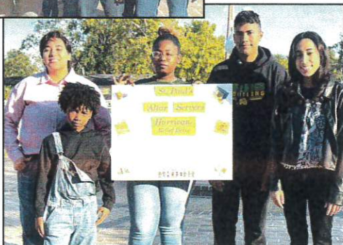
Thank you, St. Paul Church-Family, for your Support!