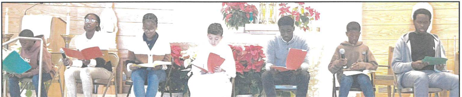
St. Paul's Religious Education students presented a skit in honor of Martin Luther King Day Sunday, January 14, 2024