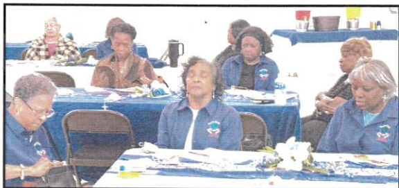
The Theme was Embracing Grace: A Journey of Prayer