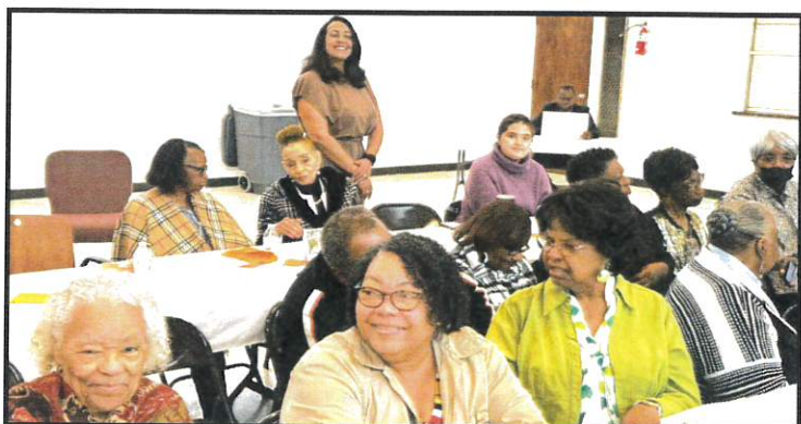
Some attendees of St. Paul's Workshop for its ministers, volunteers, and staff