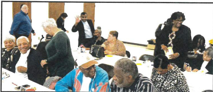
Some attendees of St. Paul's workshop for its ministers, volunteers, and staff