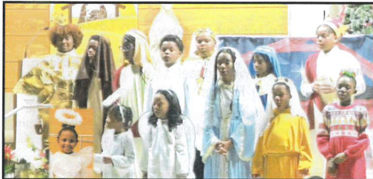
St. Paul the Apostle's children and youth participated in the Christmas Skit presented before the Christmas Vigil Mass at St. Paul. They did an outstanding job! A very special thank you to the children and youth, their parents, and the ladies who helped coordinate the play.

Vocation View: "Opening their treasure chests, they offered Him gifts." Are you beginning to see your life as a gift to be given to the Lord as a priest, deacon, religious sister, or brother?