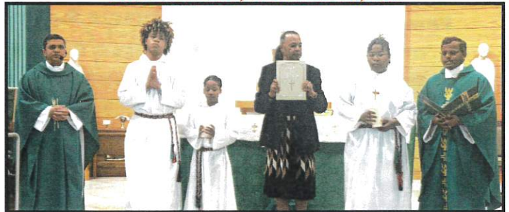
7:30 A.M. Mass