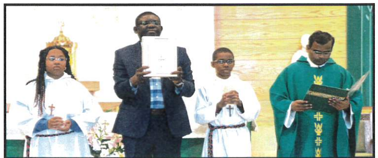
10:30 A.M. Mass