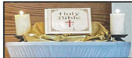
The Bible Enthroned