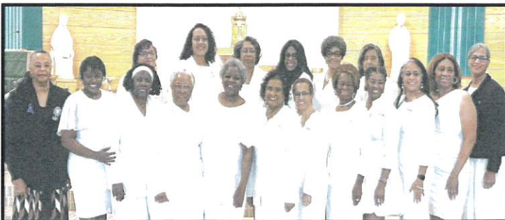
St. Paul's Ladies Guild participated in the 7:30 A.M. Mass together last Sunday