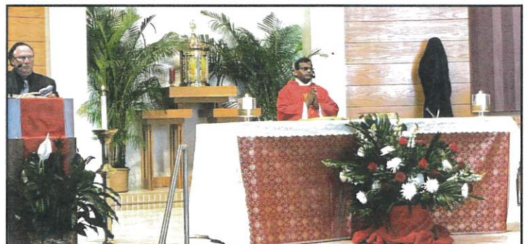
The Reading of the Lord's Passion at 10:30 A.M. Mass