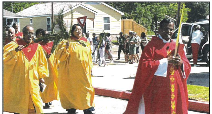
Palm Sunday Procession from the Center to the Church during the 10:30 A.M. Mass