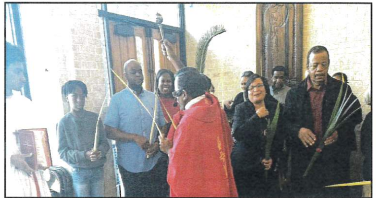
Blessing of Palms at 7:30 A.M. Mass