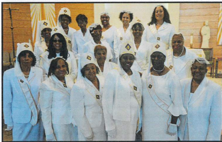
The Knights of Peter Claver Ladies Auxiliary Court 351, along with St. Paul Junior Daughters Court 351 turned out at the 10:30 a.m. Mass on April 12, 2026, Divine Mercy Sunday (Low Sunday).